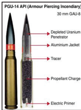
Photograph: Armour piercing munition produced by ATK Alliant Techsystems

ATK's Ammunition Systems Group operates the Lake City Army Ammunition Plant in Independence, Missouri, where it has the capacity to produce 1.5 billion rounds of small-calibre ammunition annually. It also operates the Radford Army Ammunition Plant in Radford, Virginia, where it produces rocket and gun propellants. Amongst the group's products are a number of DU shells and bullets for use in U.S. tanks, armoured personnel carriers, aircraft and howitzers. 8