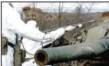
Scientific team looking for DU contamination in Kosovo.

Other personnel were exposed via inhalation and ingestion after working around vehicles struck by DU munitions. Such exposures were not considered especially dangerous at the time, because numerous epidemiological studies of uranium miners and millers working with natural uranium had shown few concrete health effects from exposure. However, the exposure of wounded personnel to uranium as embedded fragments had no medical precedent, so the earlier studies dealing primarily with inhalation or ingestion exposures in miners were of uncertain utility. As a result, questions were soon raised as to whether it was wise to leave in place fragments possessing the unique radiological and toxicological properties of DU, especially when considering that exposures might extend as long as the 40-50 years remaining of a person's life span. As these treatment questions were being addressed, a growing public concern about the long-term health and environmental impact of using a radioactive metal like DU on the battlefield fuelled forceful national and international efforts to ban the use of DU munitions. 44